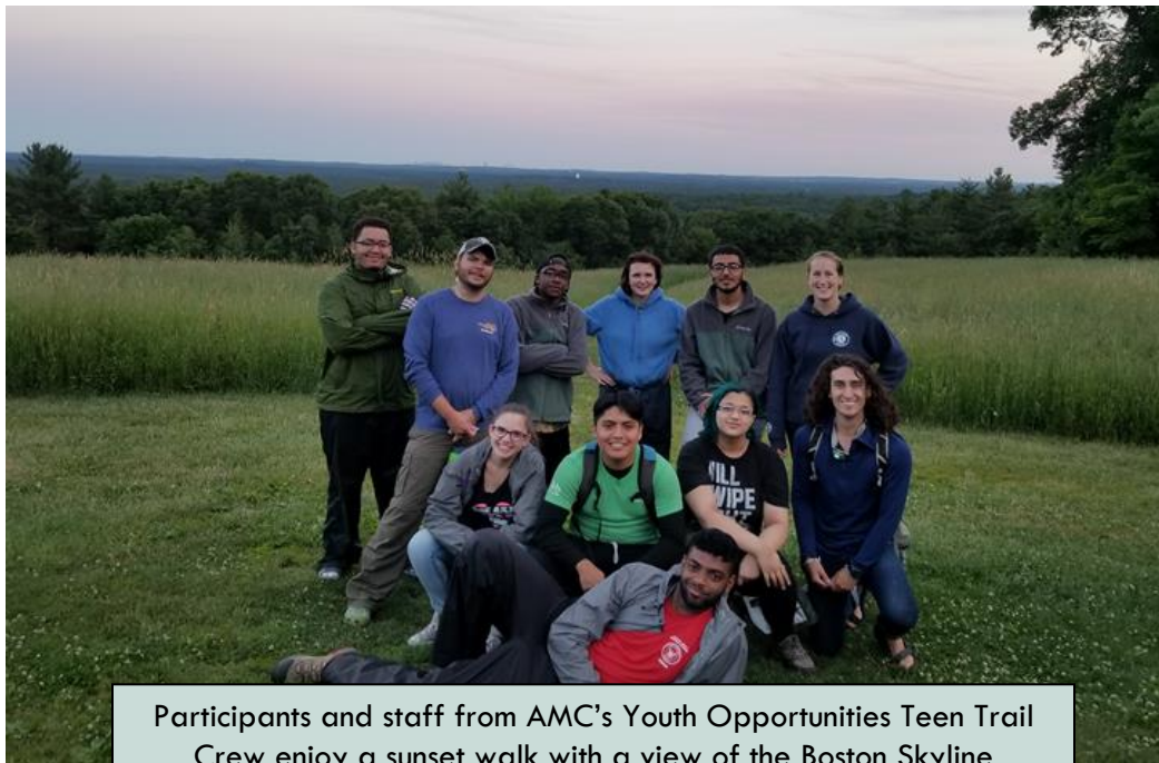
Participants and staff from AMC's Youth Opportunities Teen Trail Crew enjoy a sunset walk with a view of the Boston Skyline