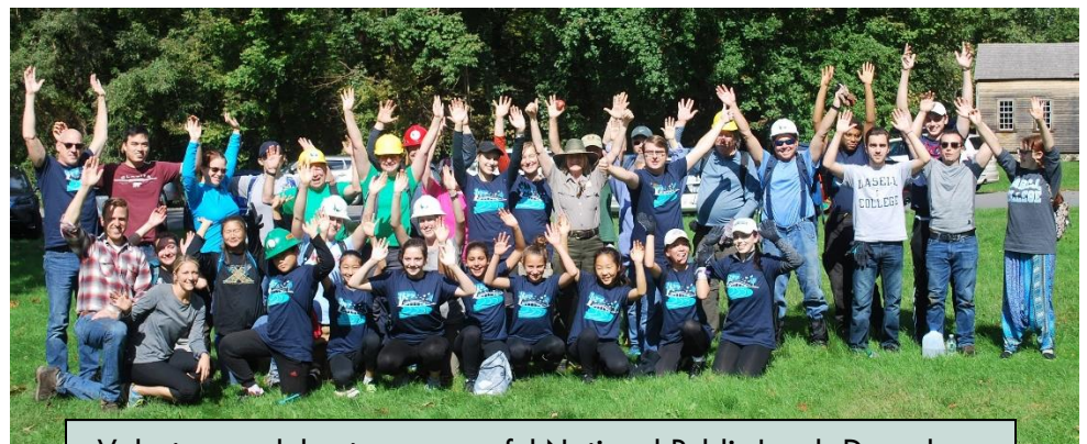
Volunteers celebrate a successful National Public Lands Day along the BCT in Minuteman National Historic Park

were able to provide snacks, pizza, and t-shirts for the volunteers.