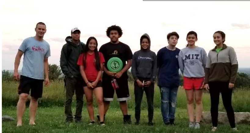
Participants and staff from AMC's Youth Opportunities Teen Trail Crew enjoy a sunset hike at Holt Hill with a view of the Boston Skyline